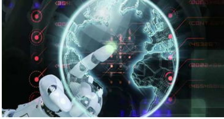
Figure 2 Big data