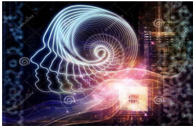
Figure 1 Big data

development of enterprises to implement network information processing mode. The information processing technology of enterprises includes three parts: information processing technology, information database technology and security and secrecy technology. It is necessary to establish an information security system to prevent attacks and threats against the processing information system. Establish a complete information database, preferably with a comprehensive record of all information in the medical profession. Pay attention to the security and confidentiality of the database, while keeping the data confidential, but also do a good job of backup, because once the computer hardware system is paralyzed, it will cause the loss of information. Enterprise information processing has been a necessary trend of development. Enterprises should vigorously support and increase the reform of enterprise processing, with the greatest support power to promote the development of information work.